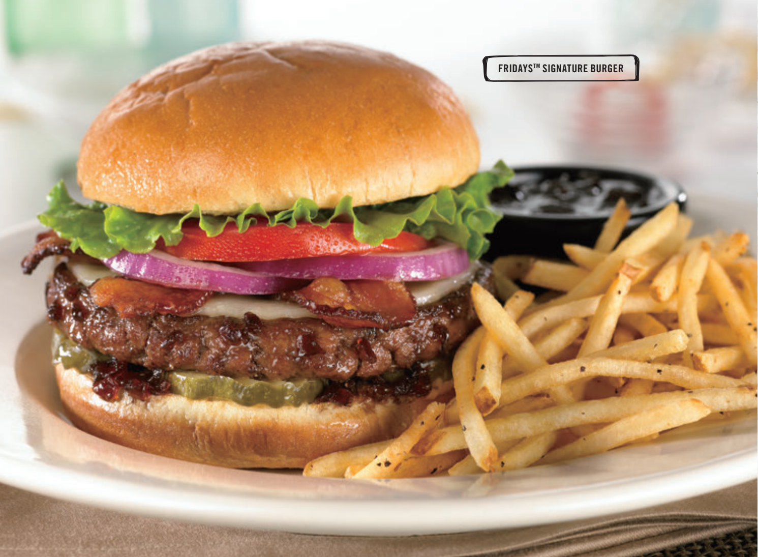
FRIDAYS™ SIGNATURE BURGER