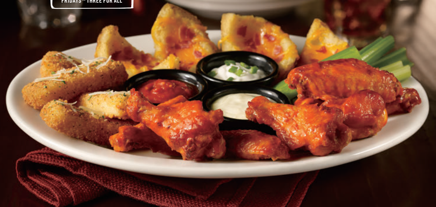
FRIDAYS™ THREE FOR ALL