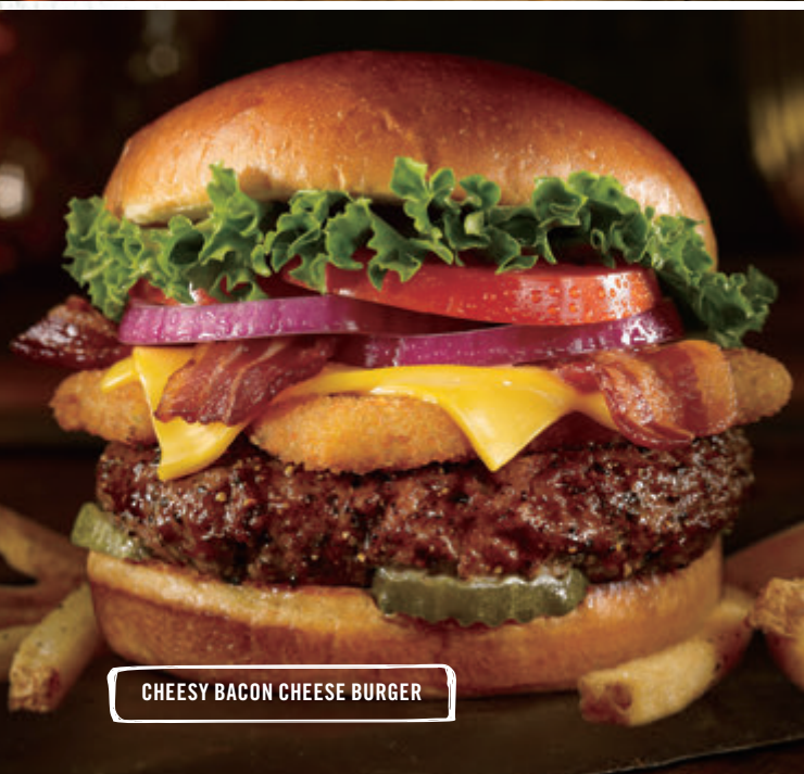
CHEESY BACON CHEESE BURGER