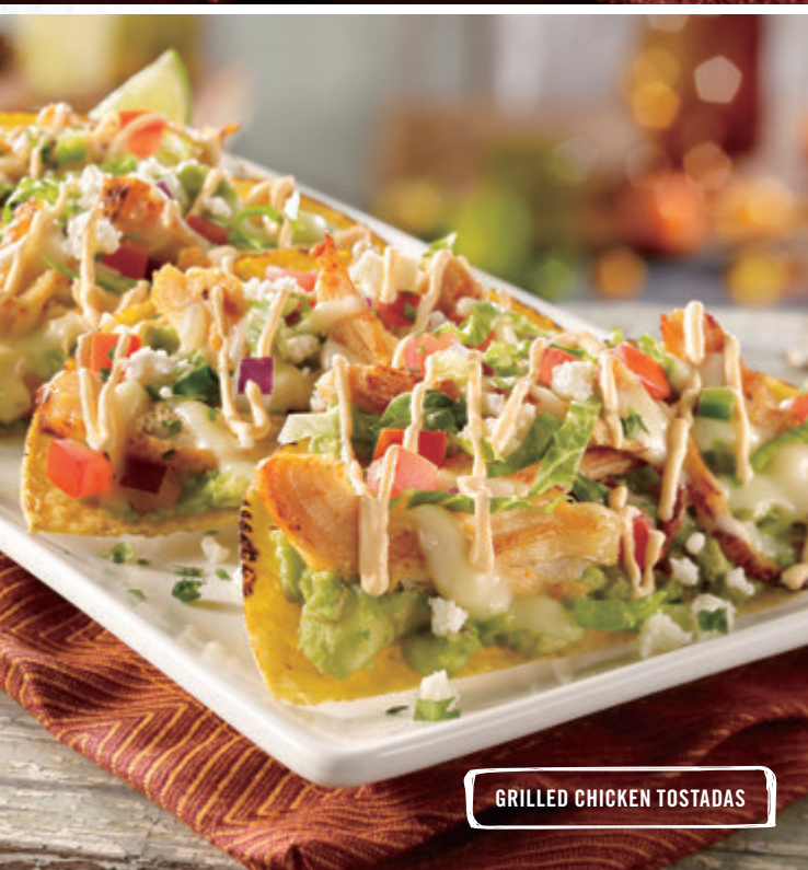
GRILLED CHICKEN TOSTADAS