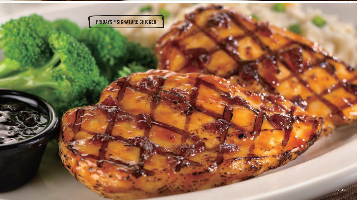
FRIDAYS™ SIGNATURE CHICKEN