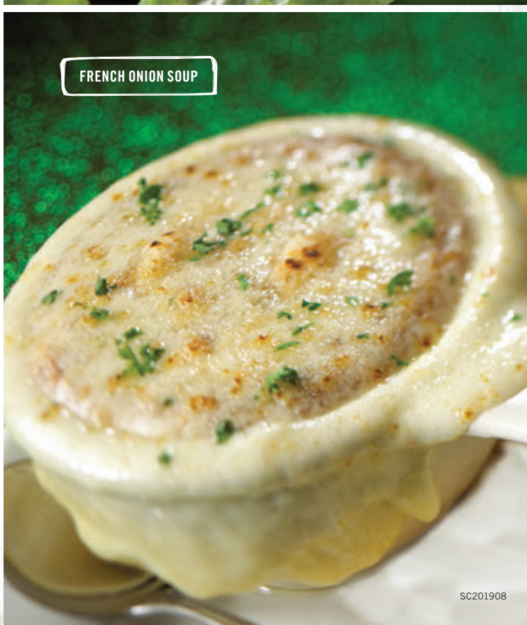
FRENCH ONION SOUP