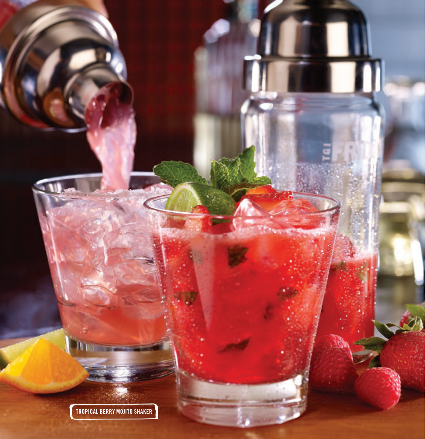
TROPICAL BERRY MOJITO SHAKER