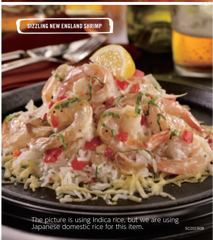
SIZZLING NEW ENGLAND SHRIMP