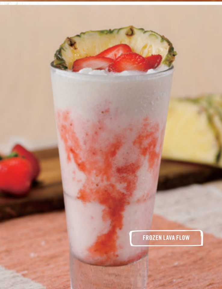
FROZEN LAVA FLOW