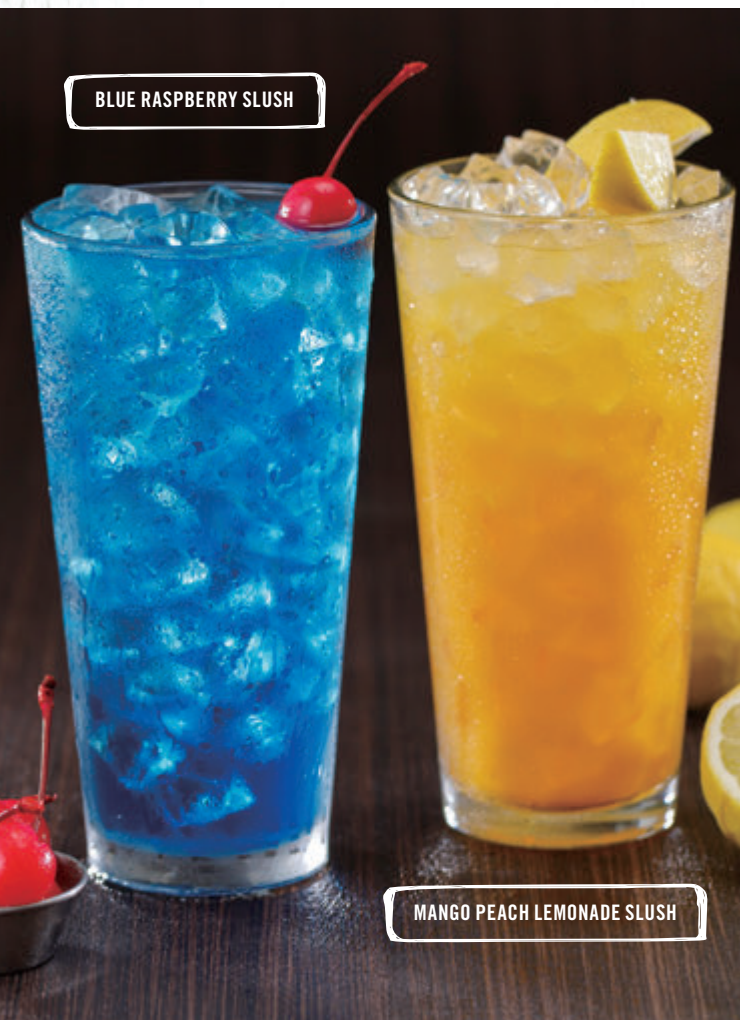
BLUE RASPBERRY SLUSH