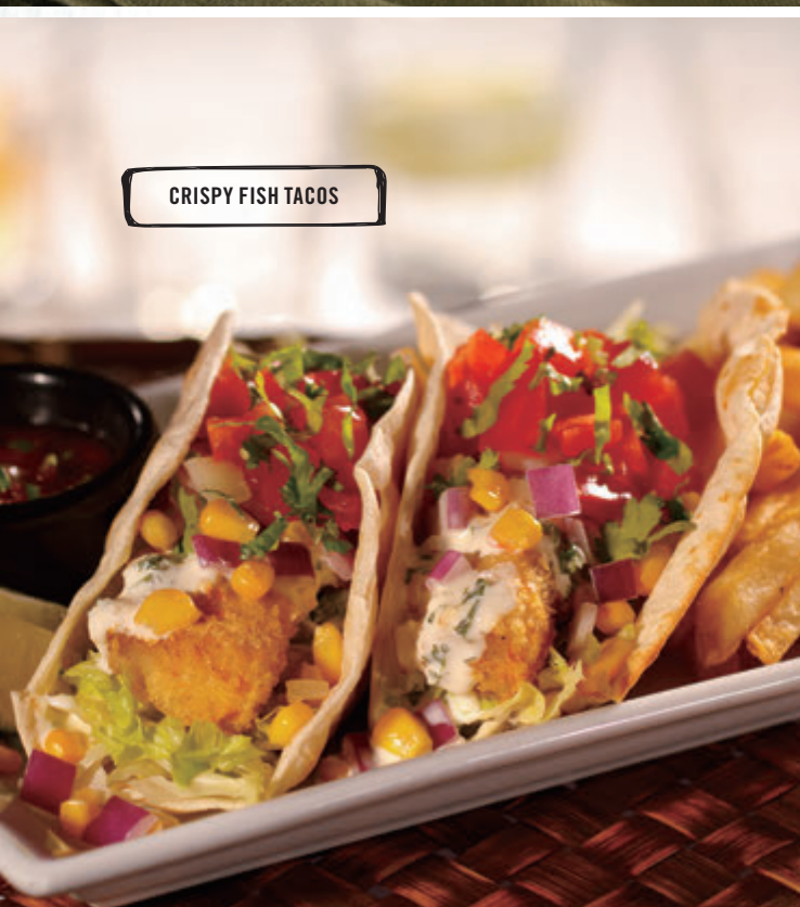
CRISPY FISH TACOS