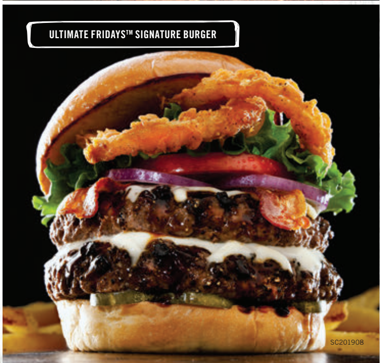
ULTIMATE FRIDAYS™ SIGNATURE BURGER