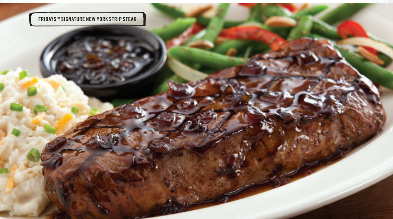
FRIDAYS™ SIGNATURE NEW YORK STRIP STEAK