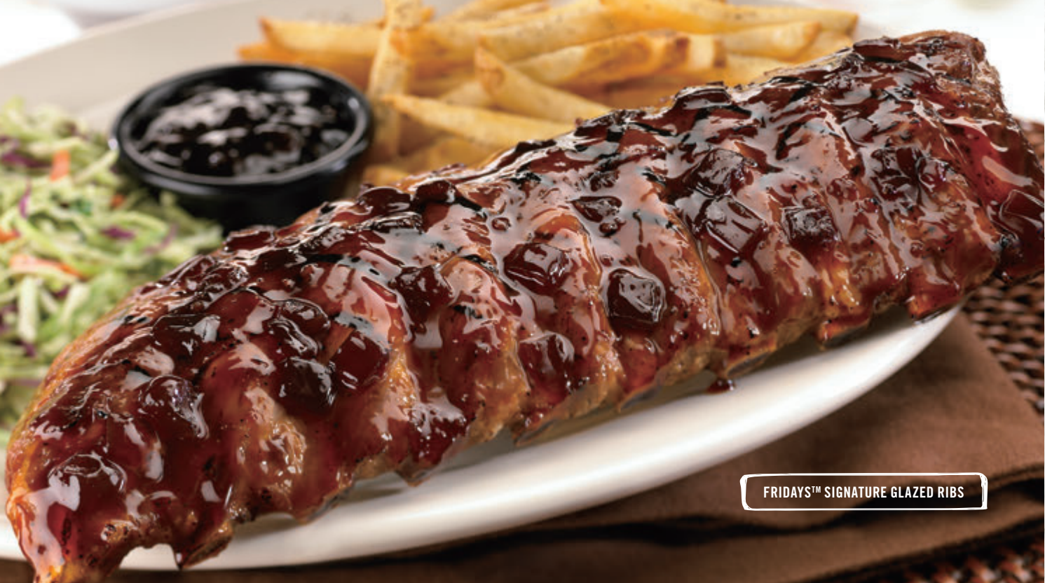
FRIDAYS™ SIGNATURE GLAZED RIBS