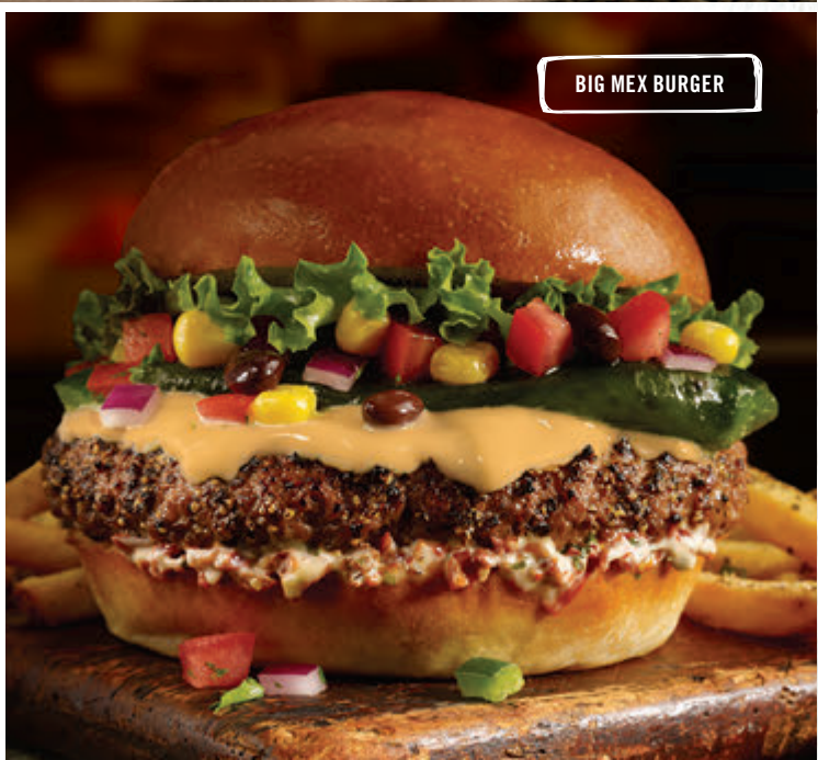
BIG MEX BURGER