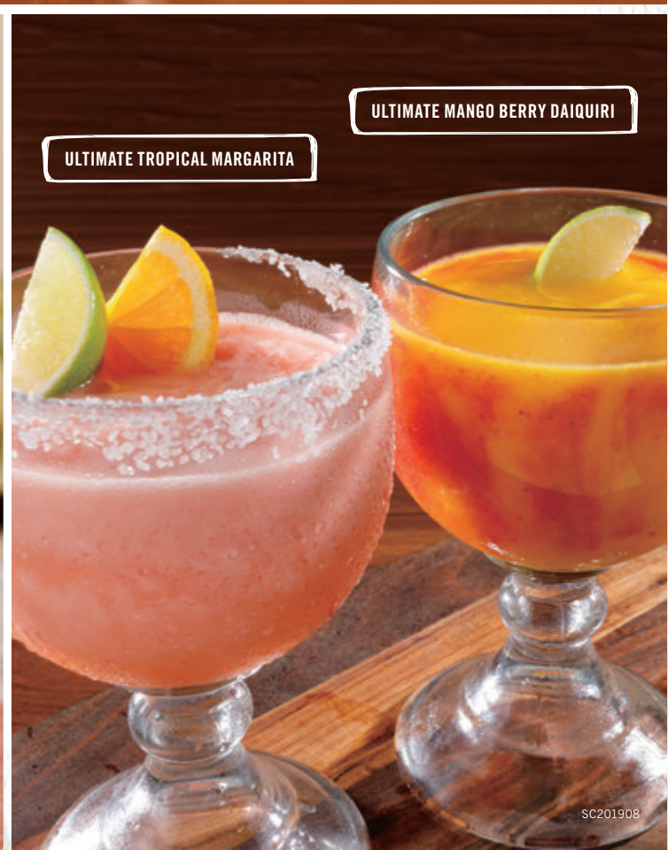
ULTIMATE TROPICAL MARGARITA