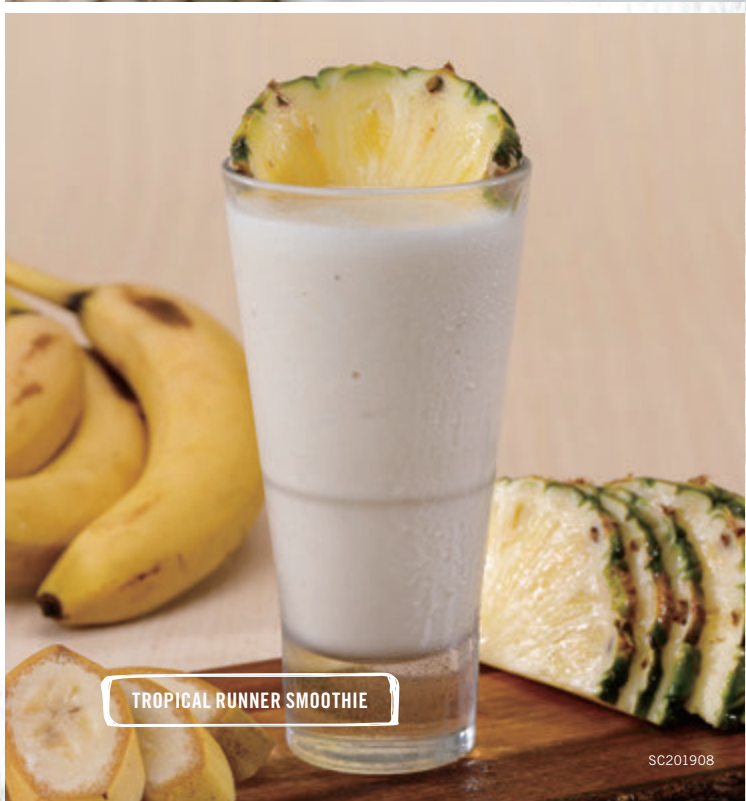
TROPICAL RUNNER SMOOTHIE