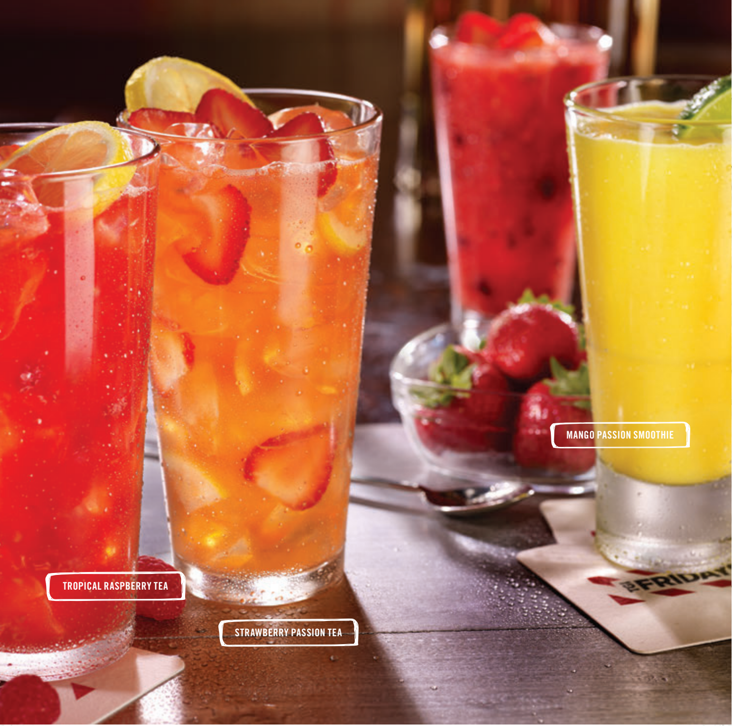
TROPICAL RASPBERRY TEA