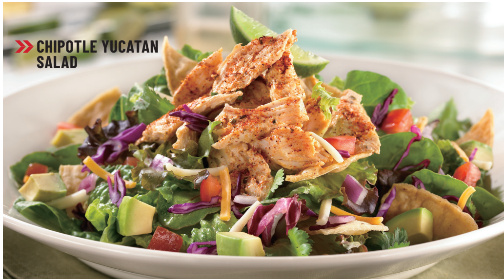
▶▶ CHIPOTLE YUCATAN SALAD

• Blue Cheese • Thousand Island • Honey Mustard • Caesar • Japanese Style • Ranch