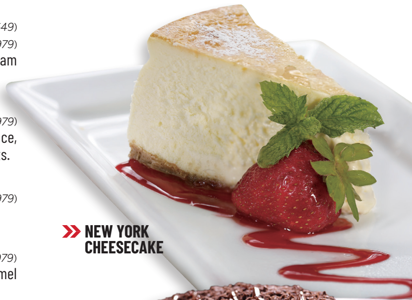
» NEW YORK CHEESECAKE

FRIDAYS™ SUNDAE ¥890 (INCLD. TAX ¥979) Vanilla ice cream topped with hot fudge, caramel sauce, nuts and whipped cream.