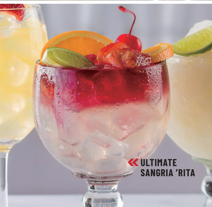
«« ULTIMATE SANGRIA 'RITA