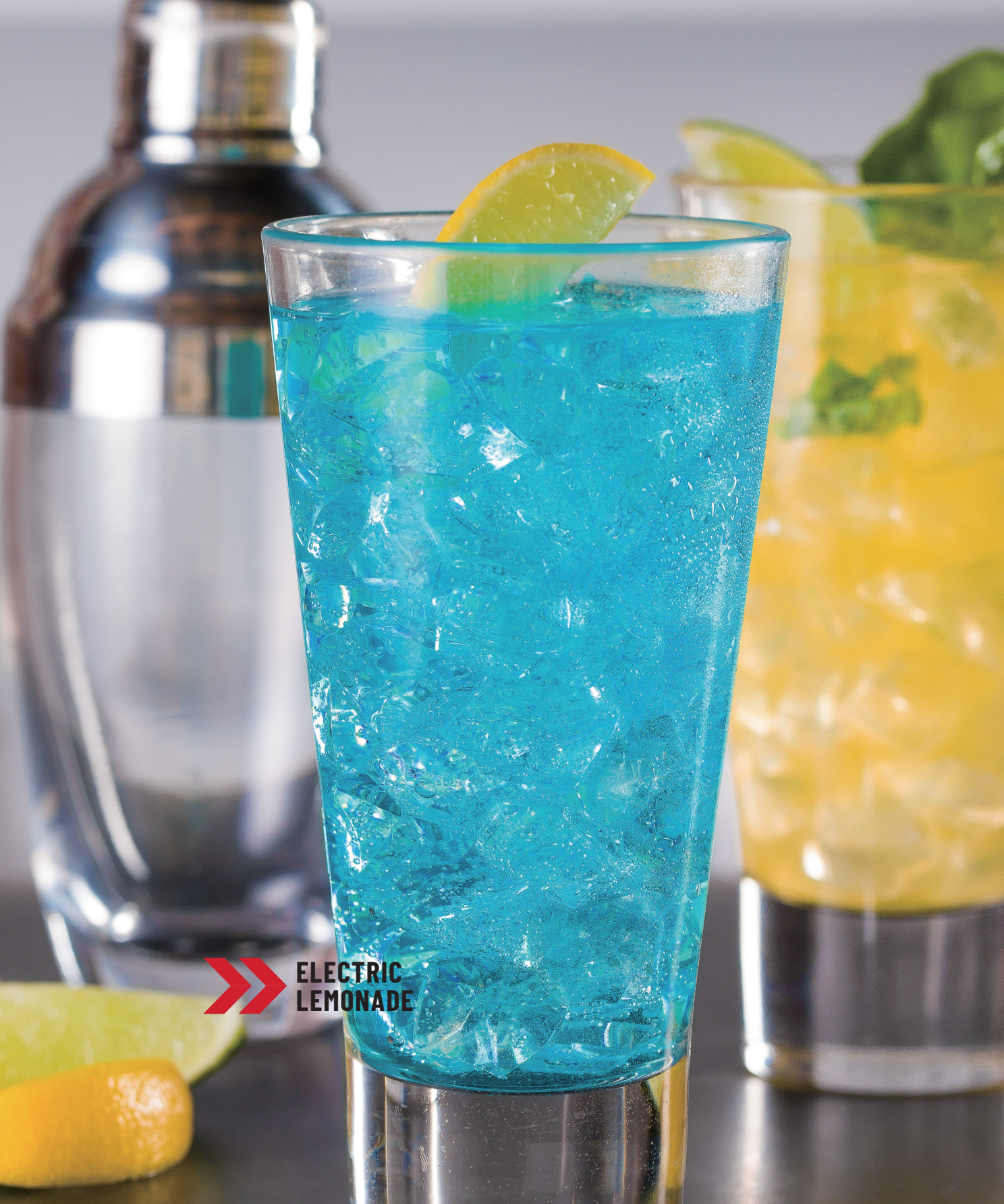
»» ELECTRIC LEMONADE