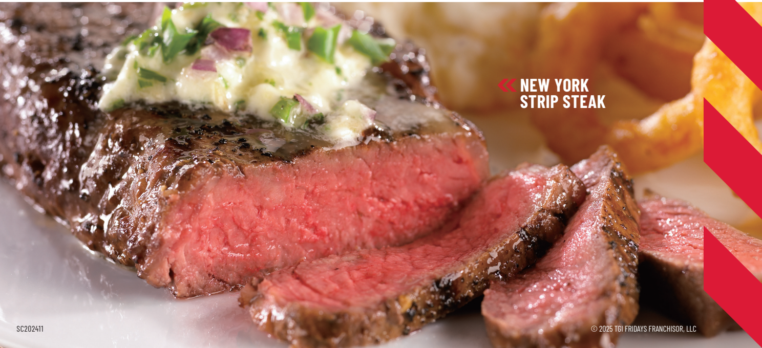
« NEW YORK STRIP STEAK

BEFORE PLACING YOUR ORDER, PLEASE INFORM YOUR SERVER IF A PERSON IN YOUR PARTY HAS A FOOD ALLERGY. IF YOU HAVE A SPECIFIC FOOD ALLERGY OR A SPECIAL REQUEST, PLEASE ASK TO SPEAK WITH A MANAGER.