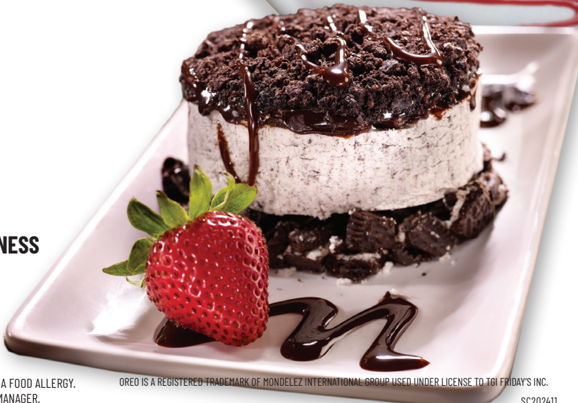
» COOKIES & CREAM MADNESS