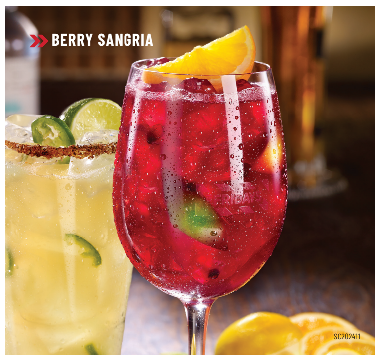
»» BERRY SANGRIA