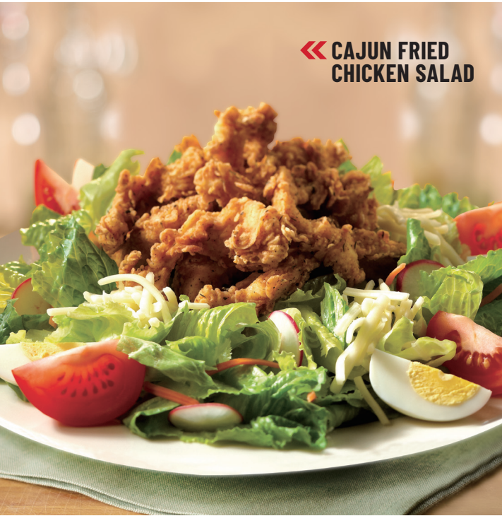
◀◀ CAJUN FRIED CHICKEN SALAD