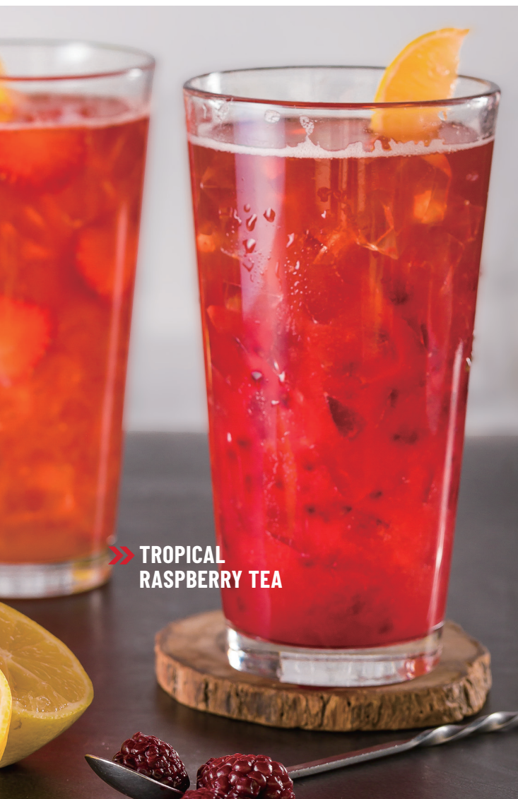
» TROPICAL RASPBERRY TEA