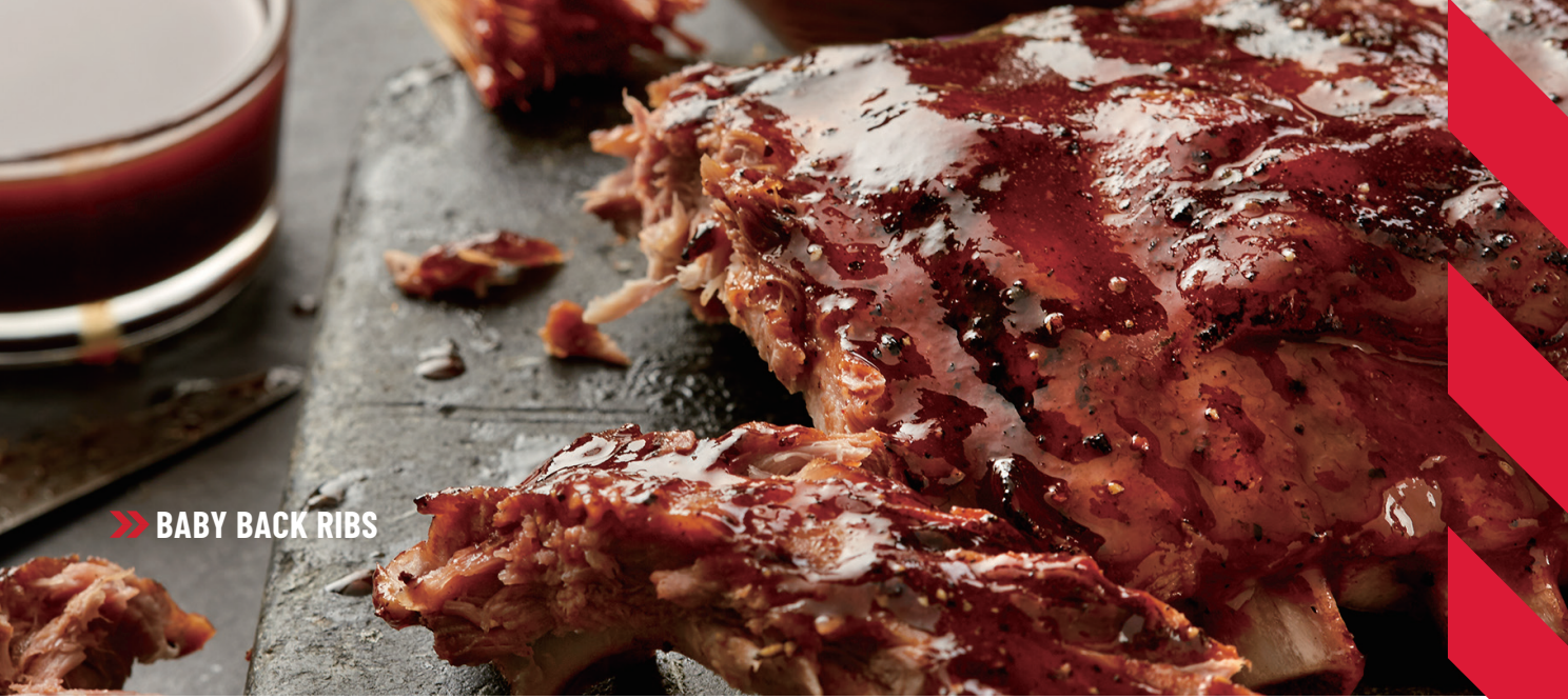
» BABY BACK RIBS