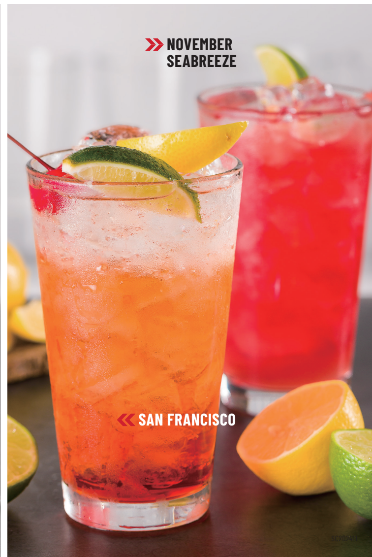
» NOVEMBER SEABREEZE