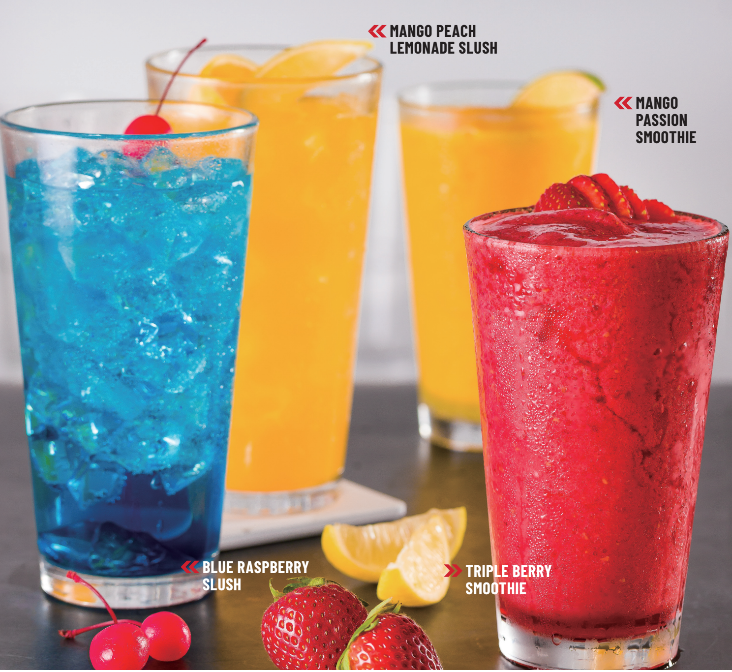
« MANGO PEACH LEMONADE SLUSH